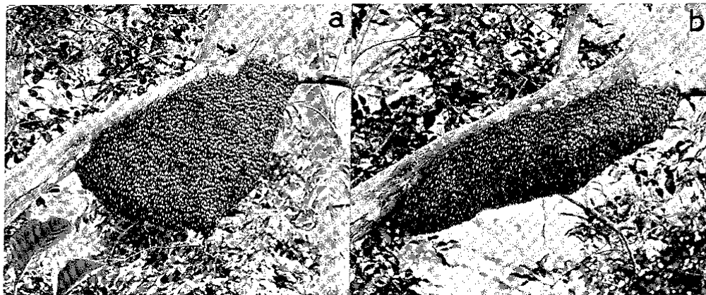
Figure 5. A. dorsata colony at Aborlan, Palawan, Philippines. a. As a normal colony, with bees covering a nest. b. As a swarm, resettled on the same branch after they had been driven away with smoke and the nest removed.

inaccessibility and a readiness to launch a massive attack. They reason that the depredations of humans, in particular, over the millenia must have constituted strong natural selection. The use of honey-hunting ladders today in Sabah indicates that this selection continues.