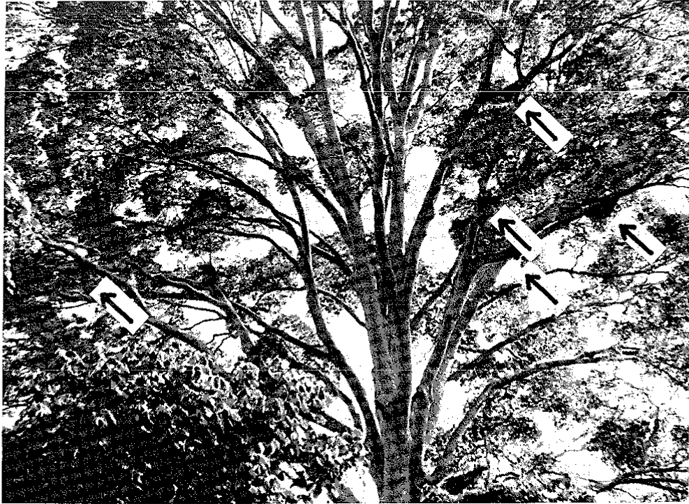
Figure 4. Crown of bee tree with four active colonies and parts of one old nest in view (arrows).